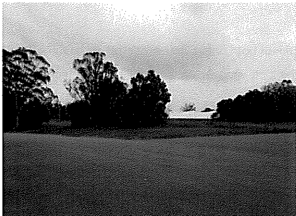
3. View from the corner of Jacaranda Avenue and Swan Street looking towards the Site.