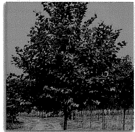
Plantus x hispanica.

Orange Jasmine Dwarf Philodendron Indian Hawthorn Lilly Pilly Cultivar