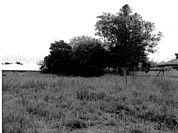
1. View across the site towards Jacaranda Avenue from Swan Street.