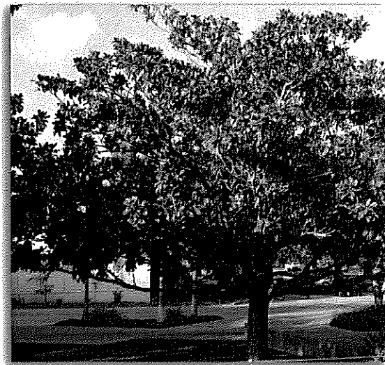
Large canopy shade trees.

A sculptural element (to be designed by others) is proposed to be placed in the forecourt to create interest for visitors and provide a focal point for the space. There is an opportunity to incorporate a function of informal seating into the sculptural element.