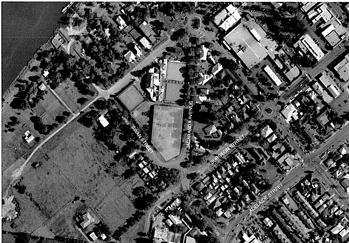
Figure 1 - Site Locality Plan