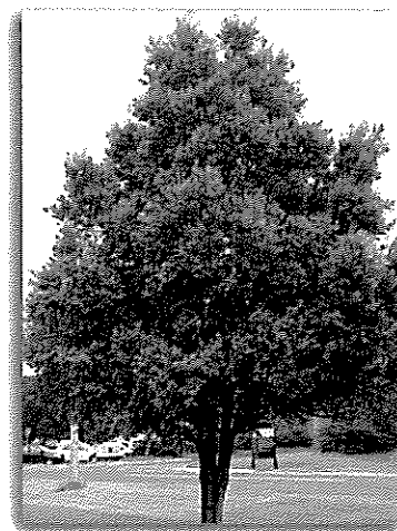
Small leaved lilly pilly.