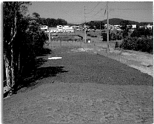
Topsoil and mulch spreading.