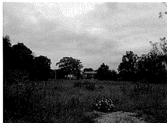
6. View looking across the Site towards Swan Street from the north eastern boundary of the Site.