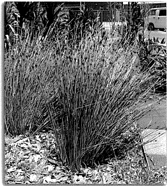
Native grasses and sedges.