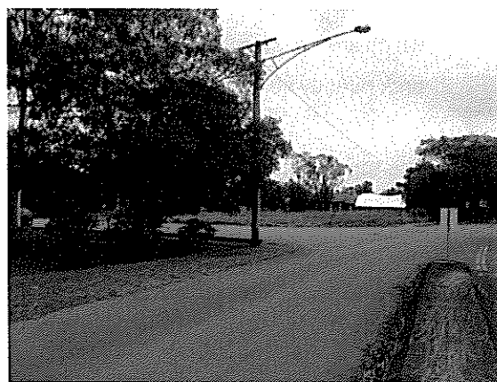
2. View of the southern extents of the Site from Jacaranda Avenue.