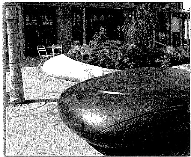
Sculptural element by others to provide informal seating.