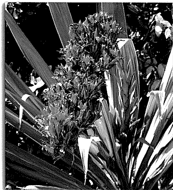
Gynea Lilly- Accent Plant