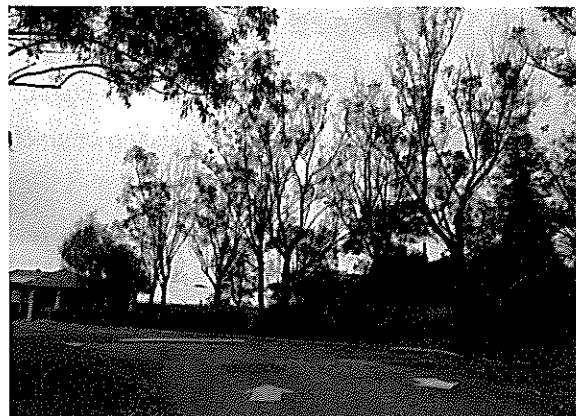
4. View of the northern boundary of the Site from driveway entry to the Bowling Club.