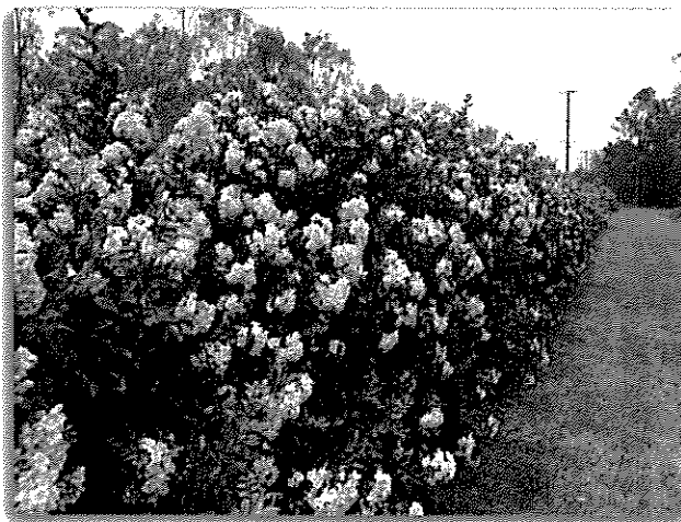
Murraya paniculata- Screen planting along boundary.

Retention of existing vegetation in the north west corner of the site assists in providing partial screening of the proposal when viewed from existing houses west of the site. Proposed planting of predominantly native trees will ensure that the landscape areas provide a positive contribution to the landscape character of the local area.