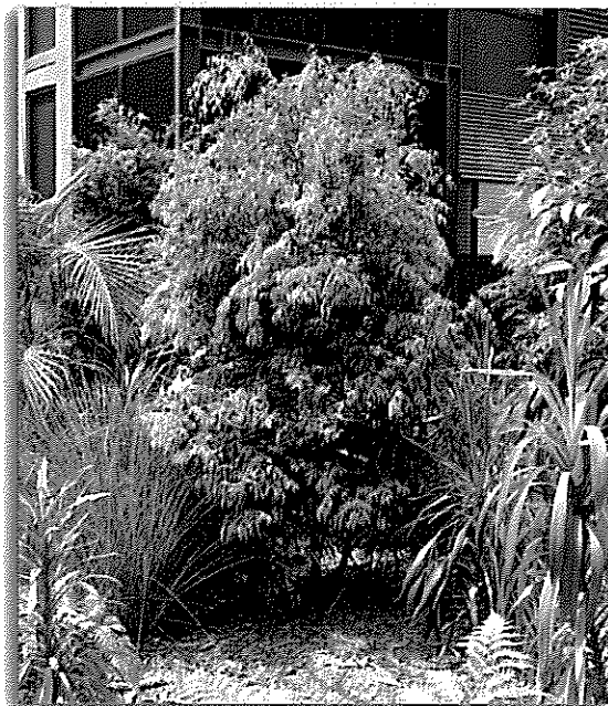
Lilly pilly - screen planting.