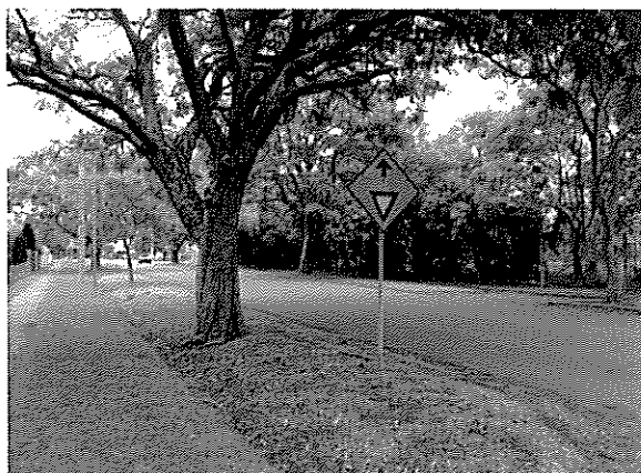
7. View south along Jacaranda Avenue with the northern boundary of the Site visible in the background.