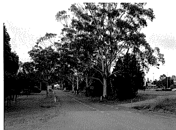
8. View north along Swan Street- Existing mature Eucalypts define the street scape.